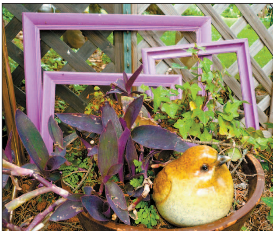
A decorative bird nestled in a potted plant with purple empty picture frames behind exemplifies a different kind of art at Art and a Country Garden on July 9 at Prairie Sky Studio in Sturgeon County.